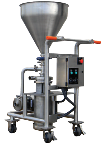
AC+ Dry Blender System